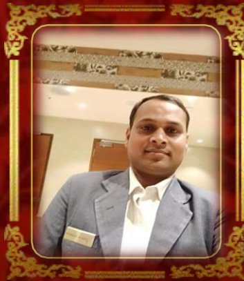
Chief Engineer Royal Orchid group Noida